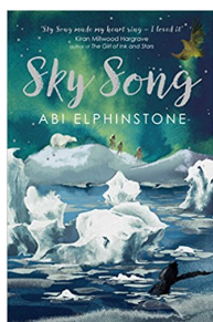
Sky Song By Abi Elphinstone