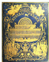
CRYSTAL PALACE & The GREAT EXHIBITION of 1851